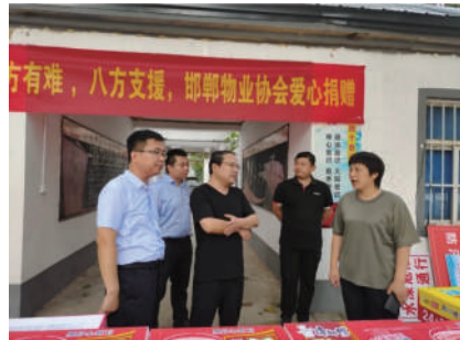
Charity donation activity