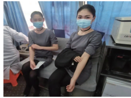
Blood donation activity