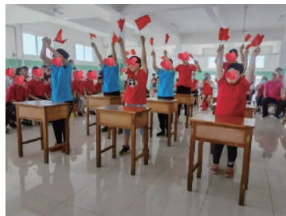
Caring activity on Children's Day