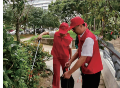
Garbage collecting public welfare activities