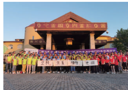
Team Building Activities