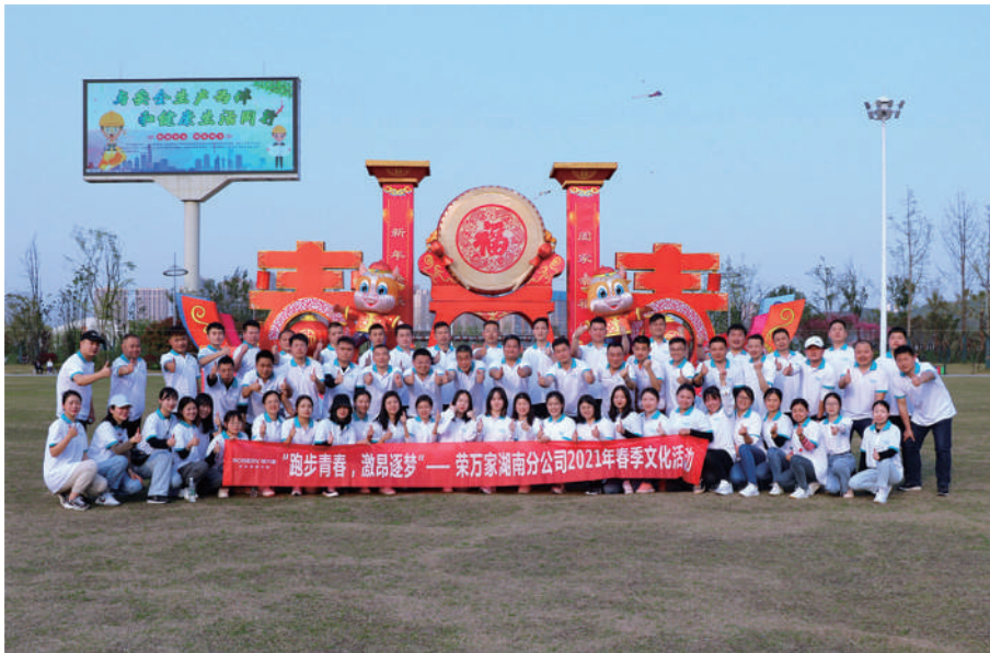
“Run for Dreams” Cultural Event

The Group actively organises employee activities, including traditional festival celebrations, team building, corporate culture building, welfare and care, to enrich the employees' leisure time.