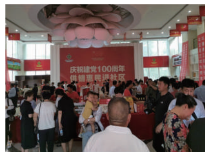
Discounting activities in community